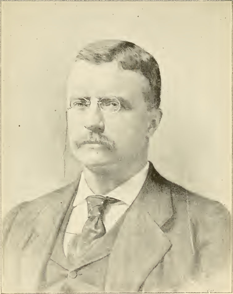
Col. Roosevelt When He Was President